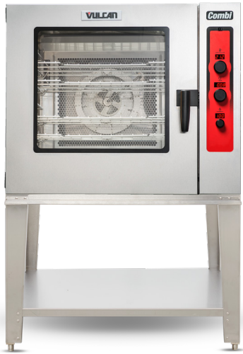
Model ABC7G Shown on stand